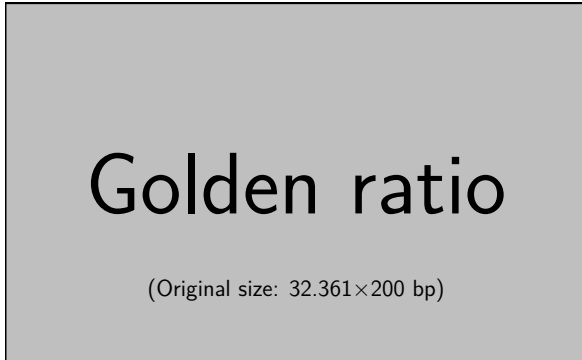
Figure 1: A figure with a caption that runs for more than one line. Example image is usually available through the mwe package without even mentioning it in the preamble.

an appropriate point within the text. The graphicx package supports various optional arguments to control the appearance of the figure. You must include it explicitly in the \LaTeX preamble (after the \documentclass declaration and before \begin{document} ) using \usepackage{graphicx} .